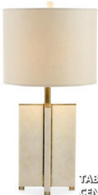
TABLE LAMP, CENTURY