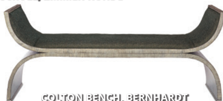
COLTON BENCH, BERNHARDT