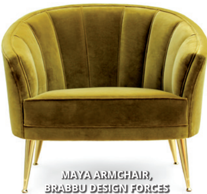
MAYA ARMCHAIR, BRABBU DESIGN FORCES

Etch Design Group represents the philosophy that good design always leaves a lasting impression, and in this decadent owners retreat, we did just that. The custom Australian-lamb fur rug and plush neutral bedding offers a soft and subtle base, which is layered with rich hues of cobalt blue and sophisticated gray. The grand four-post bed with gold leaf accents offers a Hollywood glam appeal, which we paired with a mid-century ribbed back velvet armchair. The clients' unique personal style is incorporated throughout each custom element, striking a delicate balance between purpose and beauty.