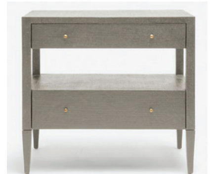
CONRAD NIGHTSTAND, MADE GOODS