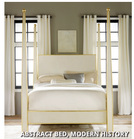
ABSTRACT BED, MODERN HISTORY