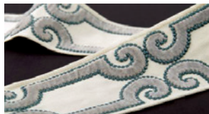
VELVET SCROLL, ZIMMER-ROFIDE